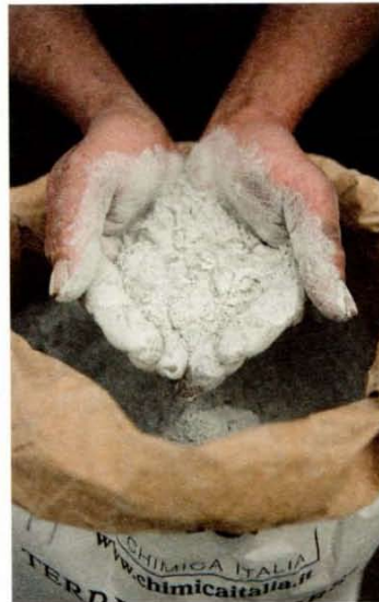
Opposite & Top: Il Taglio, Caimi & Asnaghi for HD Bottom Left: Perfect Combination, Chimica Italia Bottom Right: Terre & Color, Chimica Italia